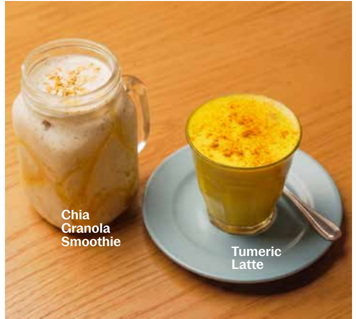
Chia Granola Smoothie

Sweet mango with a subtle ginger kick, balanced with fresh mint and citrus.