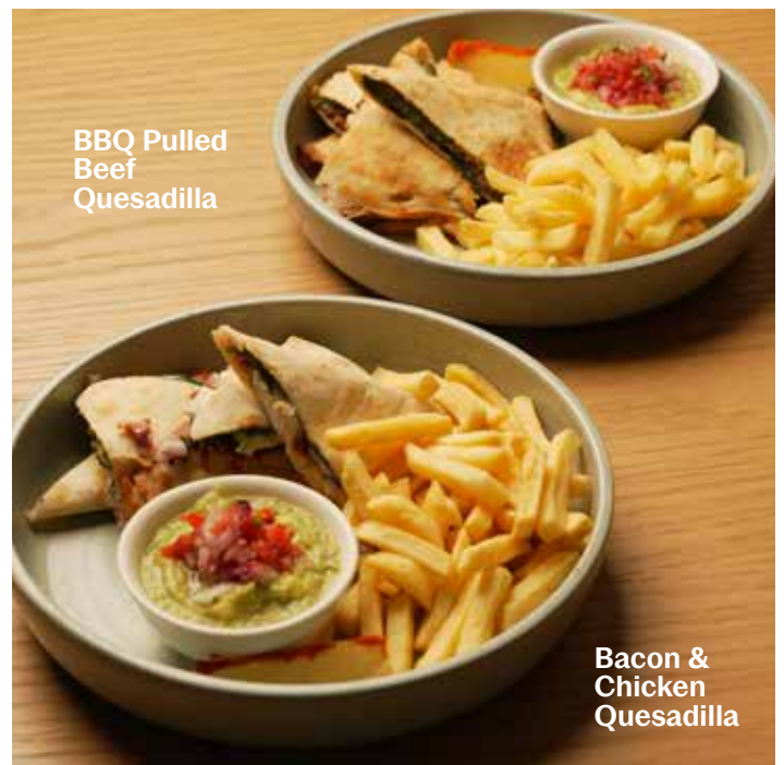
BBQ Pulled Beef Quesadilla