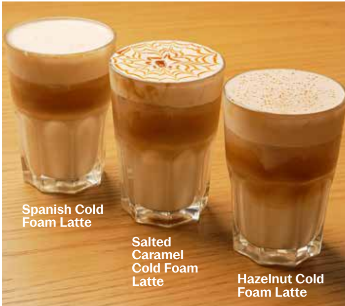
Spanish Cold Foam Latte

A smooth iced latte finished with hazelnut cold foam and soft chocolate notes.