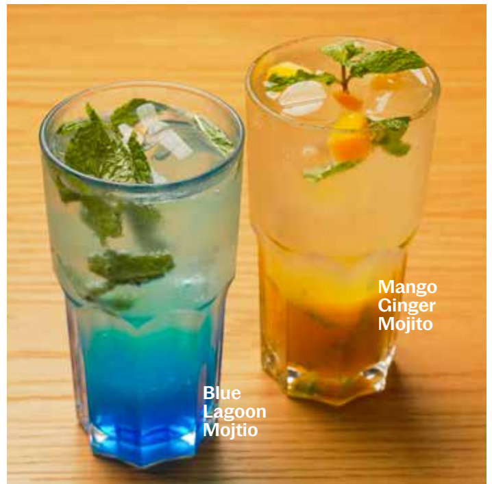
Blue Lagoon Mojito