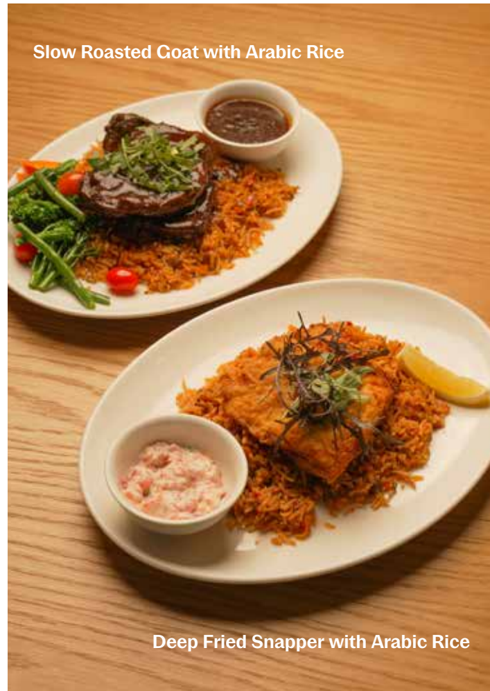
Slow Roasted Goat with Arabic Rice

Crispy fried snapper served with your choice of fragrant Arabic rice or plain jasmine rice, light, flavourful, and satisfying